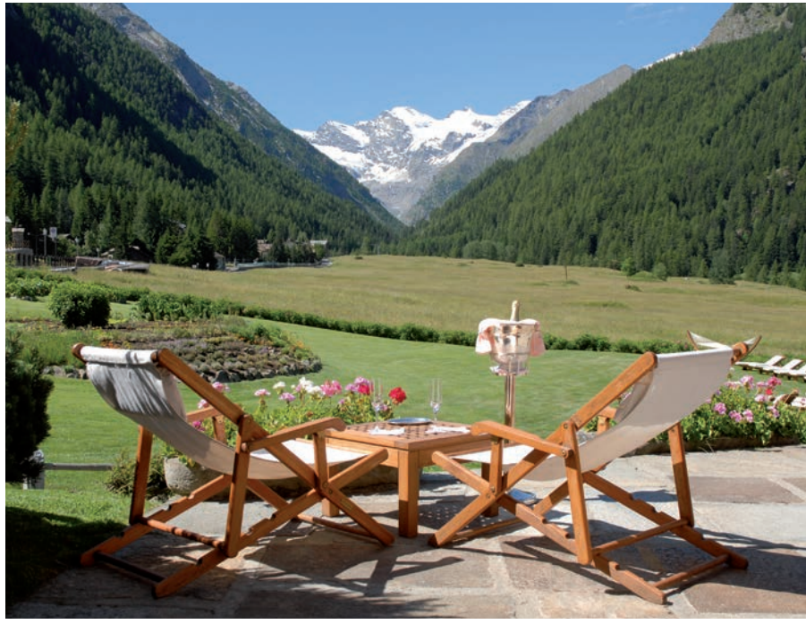
Hotel Bellevue, Cogne