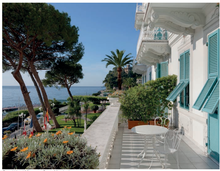
Grand Hotel Miramare, Santa Margherita

Hotel Bellevue in Cogne is a Relais & Chateaux hotel located in the Gran Paradiso National Park, ideal for a relaxing stay in the Italian Alps or as part of a touring holiday. The hotel has the feel of an elegant, historic alpine chalet. You will enjoy getting out and about amongst the fabulous scenery and could opt for a guided walk, horse-riding, cycling or fishing. Back at the Hotel Bellevue, relax in the sauna and swimming pool or have a soothing massage.