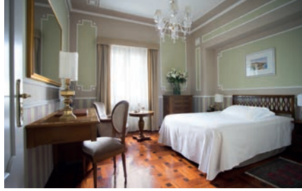
Grand Hotel Miramare, Santa Margherita