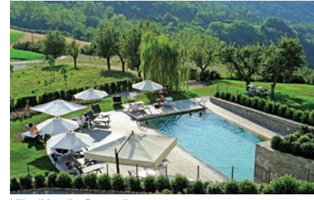
Villa d'Amelia, Benevello