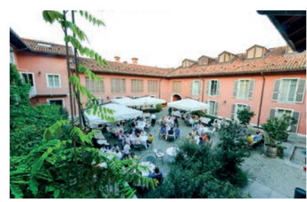
Villa d'Amelia, Benevello